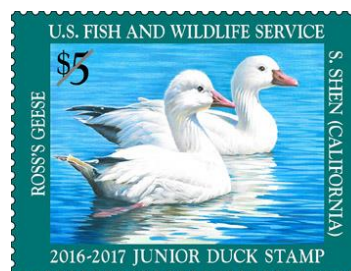
The current Jr. Duck Stamp

2017 National Junior Duck Stamp Art Contest Friday, April 21, 2017 9 a.m. to 2 p.m. Charleston Music Hall 37 John Street, Charleston, SC 29403