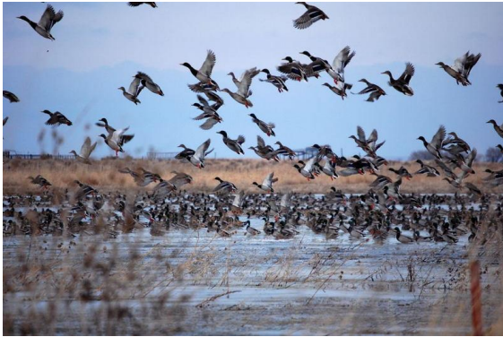
Duck rising from a PFW project.

Partners officially started in 1987, with its beginnings grounded in waterfowl management. One of the most important building blocks of the Partners Program was the U.S. Fish and Wildlife Service's (FWS) Mid-Continent Waterfowl Management Project (MCWMP). Beginning in the late 1970s, the MCWMP had a specific focus to increase waterfowl populations in a pilot area near Fergus Falls, Minnesota, through the use of innovative management techniques. Wetland drainage and the loss of upland nesting habitat were occurring at alarming rates during that time. In addition to FWS assets, Ducks Unlimited, Inc. (DU) was the primary partner in this undertaking, providing a wealth of scientific, technical assistance, and on-the-ground support.