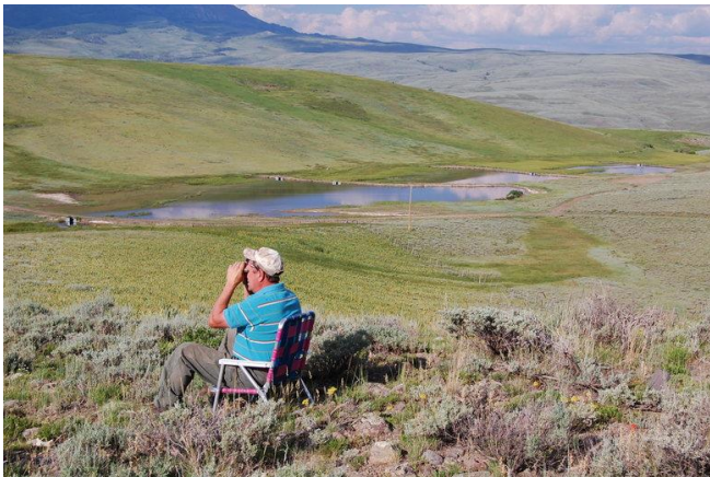
Landowner watching 'his' waterfowl broods.