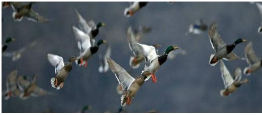
Mallards at Mingo NWR.

The refuge provides regular wintering grounds for almost two dozen species of waterfowl and other species of