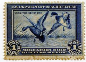
Darling's 1934-35 Stamp