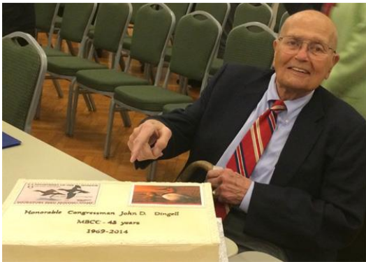
Cong. Dingell at his last MBCC meeting in 2014

So, who makes all these important conservation decisions? The original statute defined the membership of the MBCC, and it still does with a few modifications since the act passed. Members include the Secretary of the Interior serving as the Chair, the Secretary of Agriculture, the Administrator of the Environmental Protection Agency, two U.S. Senators appointed by the President of the Senate, and two members of the U.S. House of Representatives selected by the Speaker of the House - traditionally the members of Congress are selected from the two dominant political parties to maintain a bipartisan membership. The head of the USFWS Division of Realty serves as Commission Secretary. In addition, ex-officio members from any states where land interests are to be acquired are invited to participate in the discussion and to vote on acquisitions in their state. After the MBCC was given the authority to approve project funding under NAWCA in 1989, the law requires that two members of the North American Wetlands Conservation Council also serve as ex-officio members to consider and vote on any projects submitted for MBCC approval.